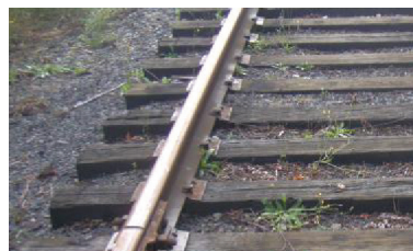
CROSSING® + SFM + GLYPHOSATE + 2,4-D