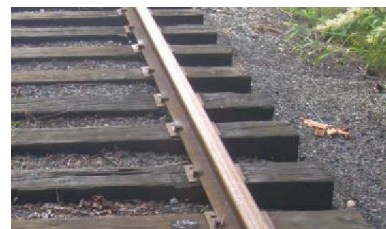
PAYLOAD® HERBICIDE + SFM + GLYPHOSATE

The Payload Herbicide program delivers outstanding control for railroad applications. Wichersham, WA — September, four months after application.