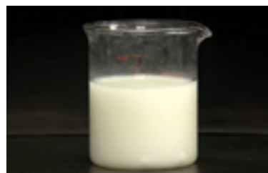
Even after two hours, Tuscany SC stays in suspension

See label for complete directions for use, including chemigation application rates and directions for use on potatoes.