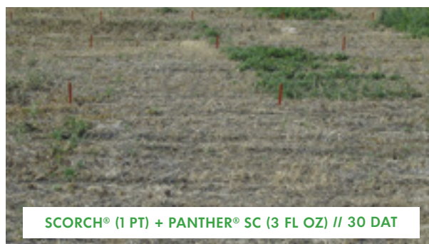
BURNDOWN + RESIDUAL // KOCHIA