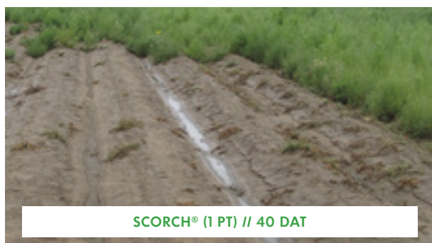
BURNDOWN // KOCHIA AND RUSSIAN THISTLE