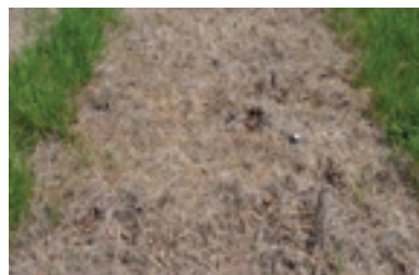
March 7, 2016 (56 DAA) | University of Georgia