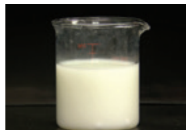
Even after two hours, Clipper SC stays in suspension