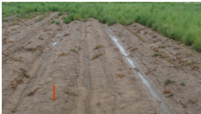
May 27, 2015 – 40 days after application of Scorch at 1.0 pint/A. Lubbock, TX – mixed population of kochia and Russian thistle in background.