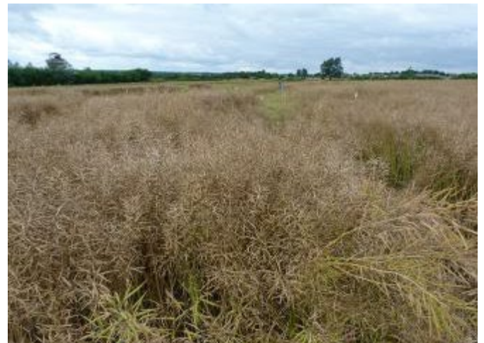
AST glyphosate + adjuvant