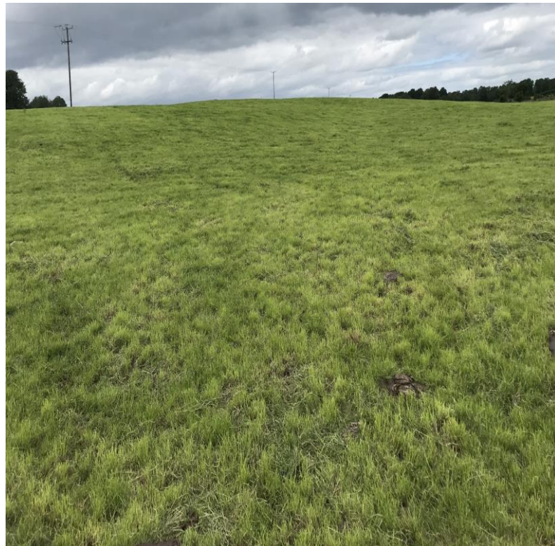
Docks Pre Application 05.07.19