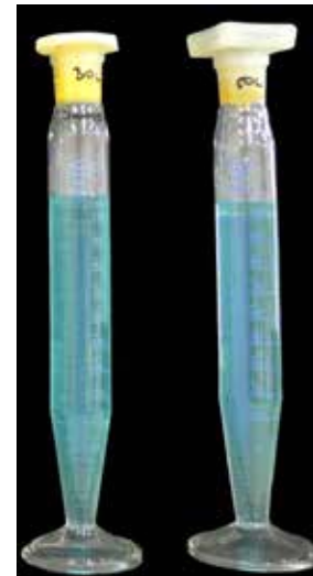
1.6 L/ha Cobber 475 + 1 L/ha Gladiator OptiMAX