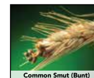
Common Smut (Bunt)