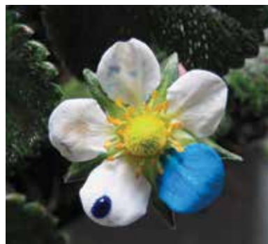
Strawberry flower showing the spreading difference of a water droplet on one petal vs Flume on another.

Observe all labelled withholding periods. Residues are not increased.