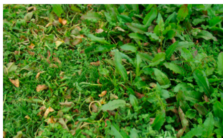
2 weeks after spraying – Dockstar 2L/ha + Baton 800WSG 2kg/ha on left; untreated on right