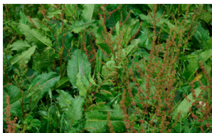
Untreated at 2 months after spraying