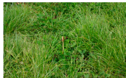
Dockstar 2L/ha + Baton 800WSG 2kg/ha at 2 months after spraying