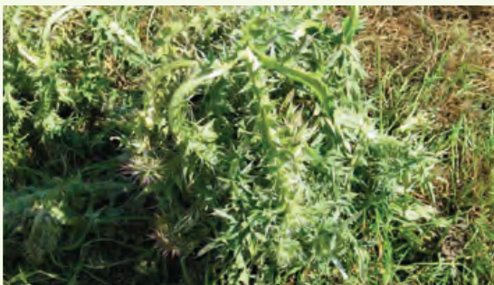
Conquest-treated nodding thistle 13 days after application

Conquest is also suitable for use in carpet weedwipers and as a broadcast application. Refer to the product label for details.