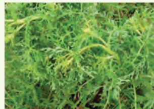
Conquest-treated ragwort 5 days after application