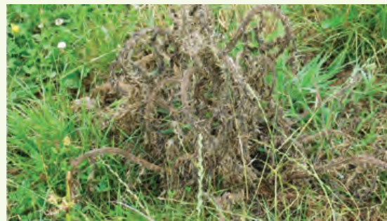
Conquest-treated nodding thistle 48 days after application