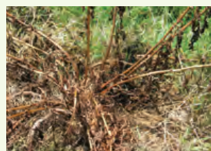
Conquest-treated ragwort 39 days after application