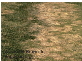
William M. Brown Jr., Bugwood.org

Pink snow mould: Fungal spores are web-like and pile up on the leaves of infected grasses, producing a white to pink to salmon colour on circular patches of matted grass. On taller-mown turf, disease patches may not be circular. Pink snow mould does not produce sclerotia. Under severe conditions, the fungus can kill the crowns and roots of grass as well as the blades. Unlike grey snow mould, snow cover is not necessary for pink snow mould infection.