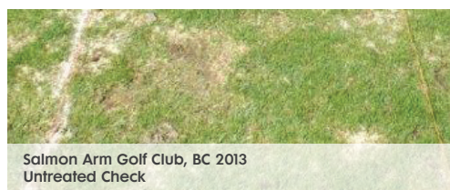
Salmon Arm Golf Club, BC 2013 Untreated Check