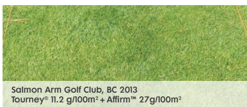
Salmon Arm Golf Club, BC 2013 Tourney ® 11.2 g/100m 2 + Affirm ™ 27g/100m 2

For additional protection, include a contact such as chlorothalonil or fluazinam.