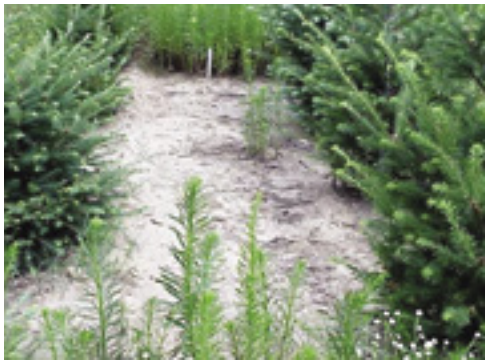
TREATED WITH SUREGUARD