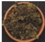
SUREGUARD + ADJUVANT 107.3g ai/ha + 0.25% v/v