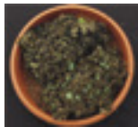
SUREGUARD 107.3g ai/ha